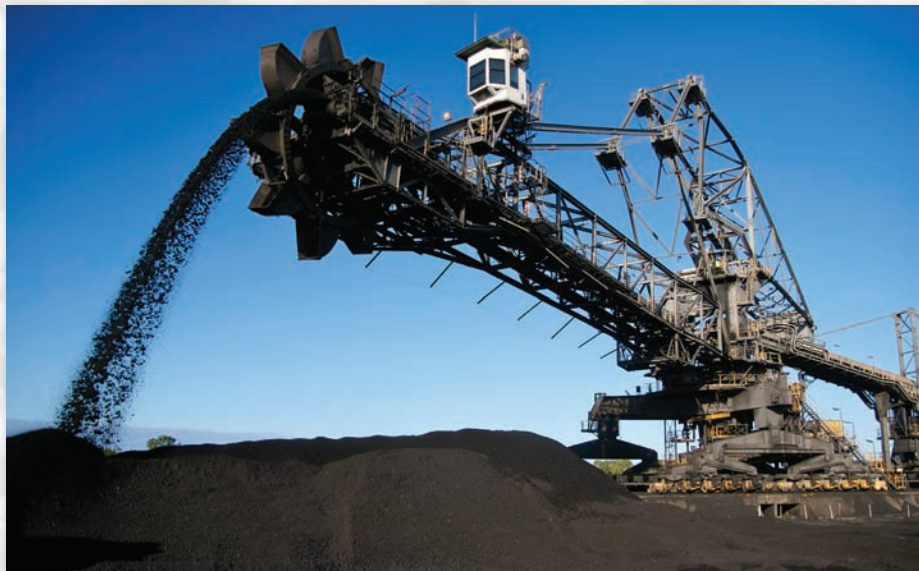
Use CRC Extreme Duty Silicone to reduce friction on metal-to-metal contact areas.