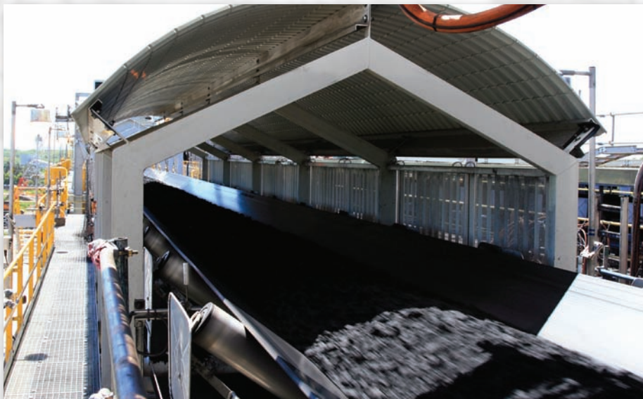
Use CRC Heavy Duty Degreaser to remove dirt, grime & corrosion from moving parts and increase the operating efficiency of equipment.