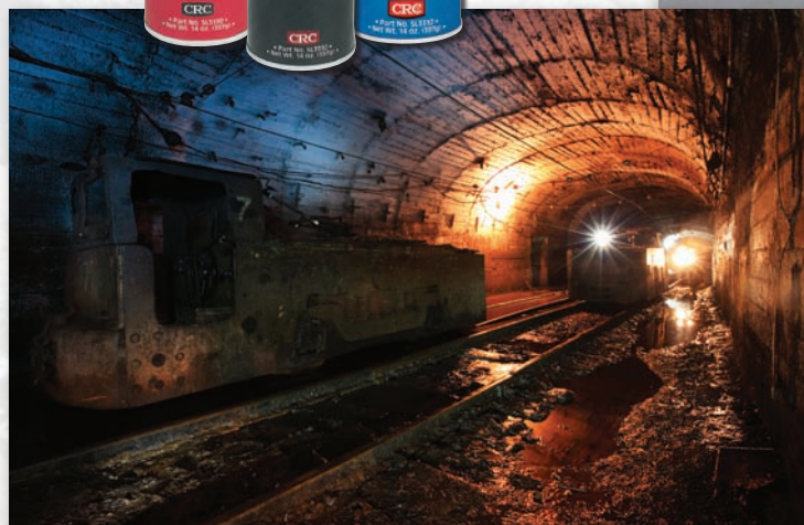
Sta-Lube® Sta-Plex™ Premium Red Grease is excellent for use in extreme pressure situations.