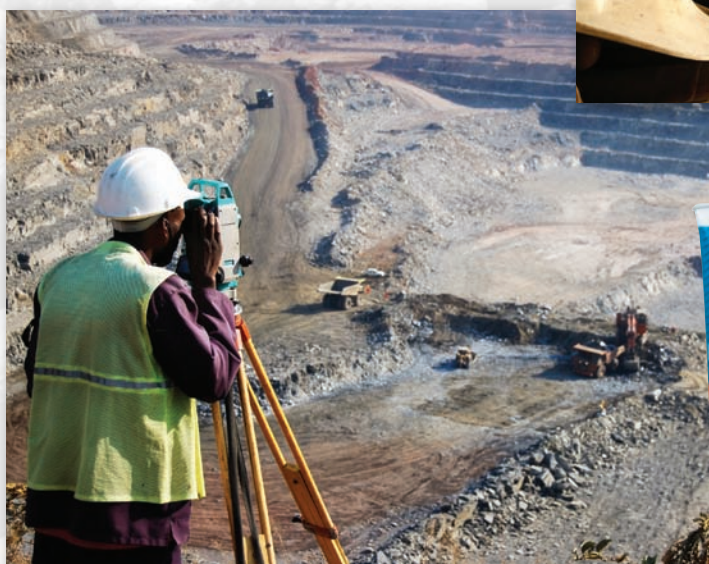
CRC Sunscreen Towels are water and sweat resistant and protect with an SPF of 30+.