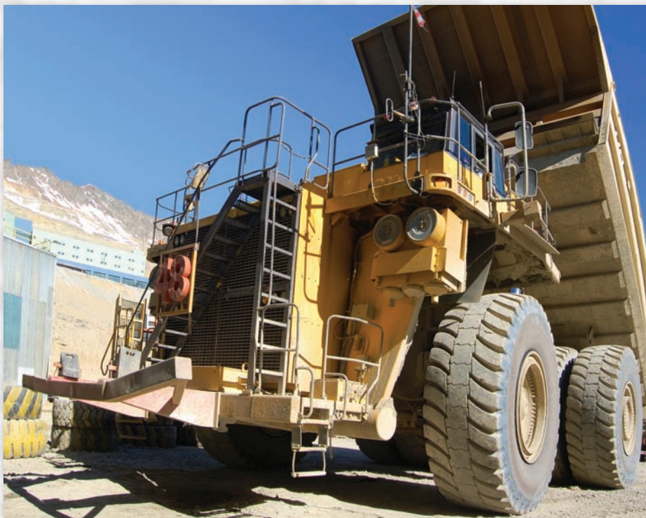
CRC Diesel™ Cold Flow™ Anti-Gel with Lubricity prevents fuel gelling & waxing and is formulated for cold weather use in all diesel equipment.