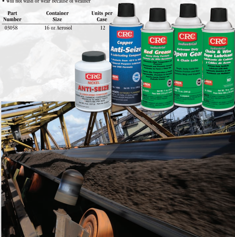
CRC Extreme Duty Open Gear & Chain Lube resists wash or wear associated with weather exposure.