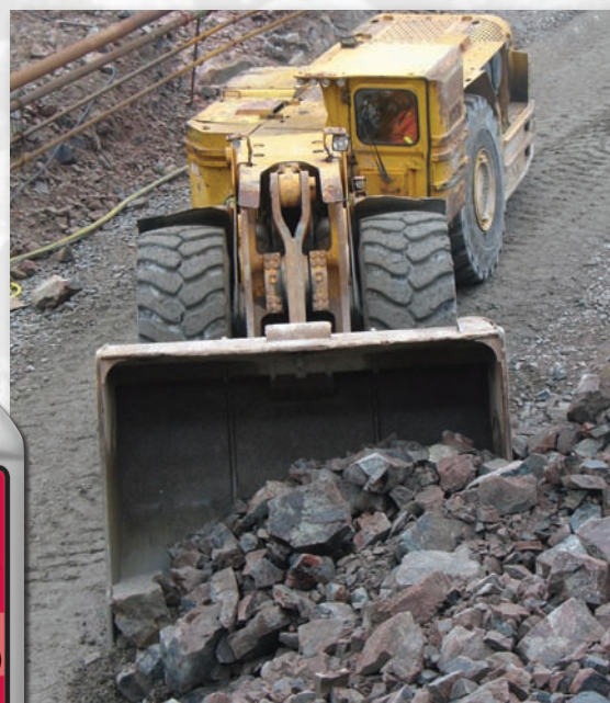
CRC Rust Converter instantly stops rust and protects metal surfaces for years.