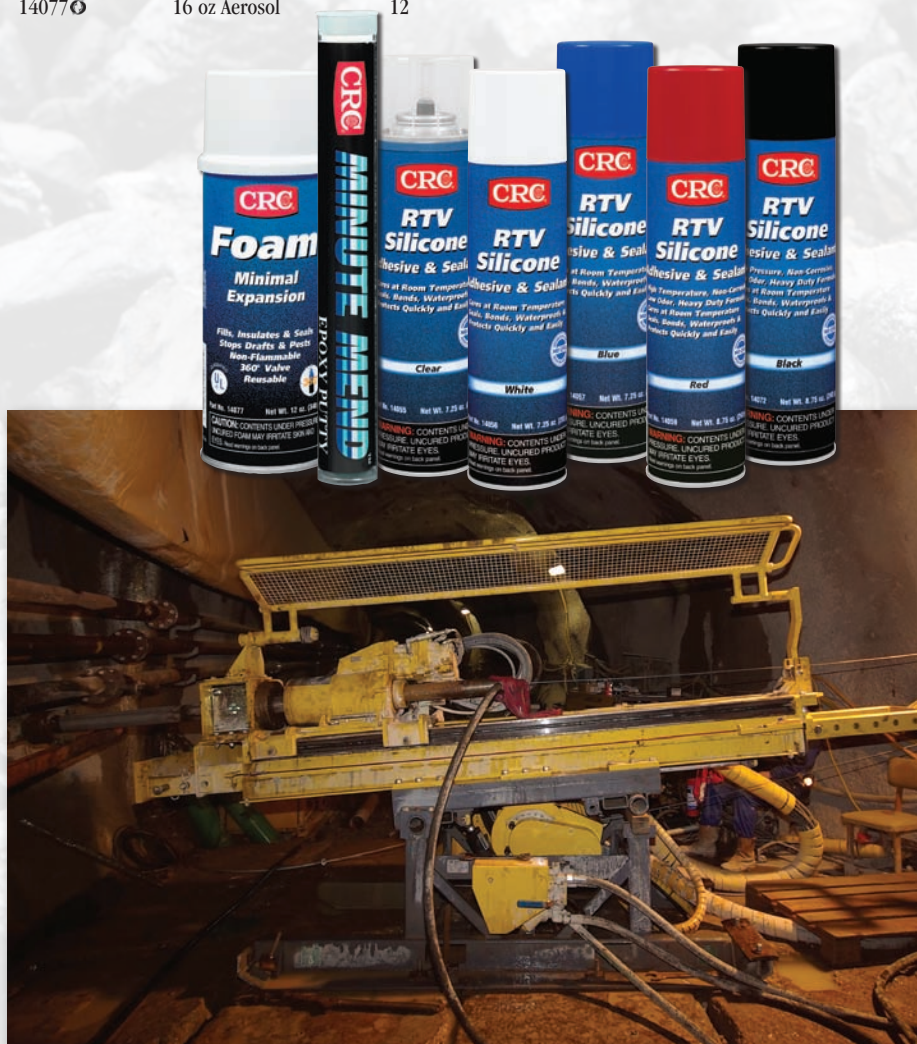
Repair leaky gaskets in minutes with CRC Minute Mend™ Epoxy Putty.