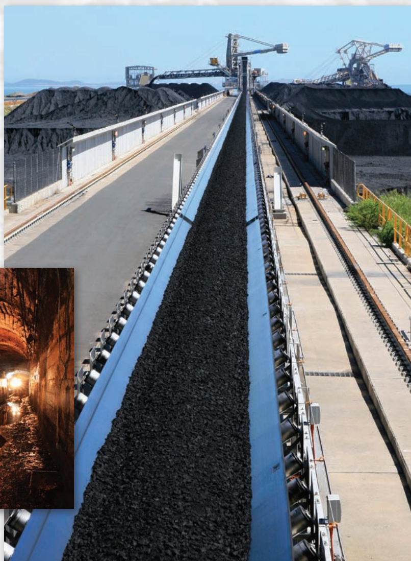
Use Sta-Lube® MolyGraph® Multi-Purpose Lithium Grease on u-joints, bushings and wheel bearings.