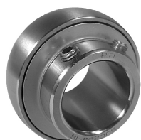
SUC Setscrew Wide Inner Ring