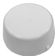
Closed Cover (CL) for Thermoplastic Housings