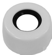
Open Cover (OP) for Thermoplastic Housings