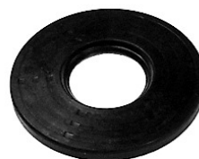
Flange Back Cover (BK) for Thermoplastic Housings *Narrow Inner Ring Inserts Only