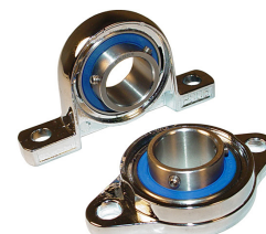
Light Duty Stainless