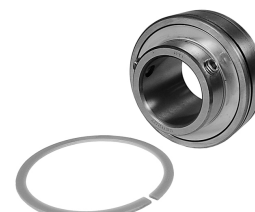
SSER Setscrew Cylindrical O.D.