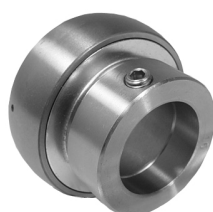
SHC Eccentric Wide Inner Ring