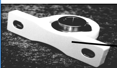
SHCTP/SUCTP Pillow Block