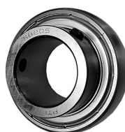
SSB Setscrew Narrow Inner Ring