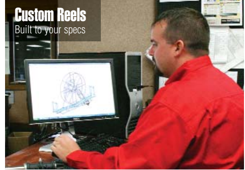
Custom Reels Built to your specs